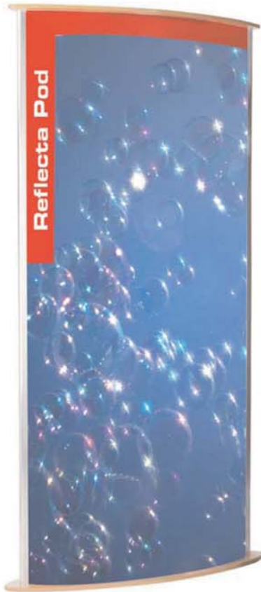
2m Reflecta Pod

A range of graphics pods and lightboxes, perfect for demonstration units or for instore displays and exhibitions.